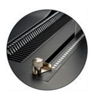
Reliable Power Punching Punches up to 20 sheets of 20lb. bond with punch button or hands-free foot pedal.